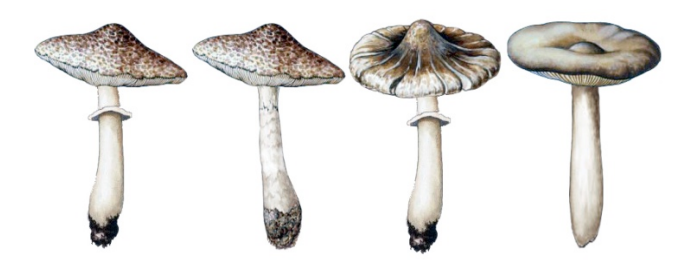
Figure 2: Example mushrooms. There are three possible caps and three possible stems. Among these examples, the first and second have the same cap, and the first and third have the same stem. No others overlap in stem or cap.

Phonological stimuli were presented auditorally, in the form of instructions such as "Find pile." Participants responded by clicking on one of the mushrooms. Initially, they just had to guess. If they clicked on the incorrect item,