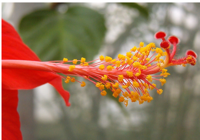
A Lily's Offering