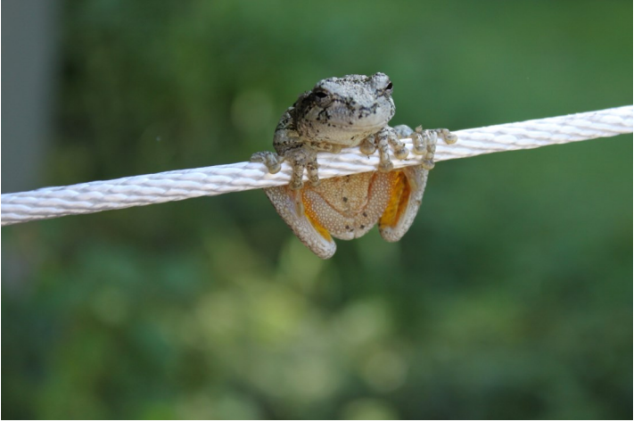
Tree Frog