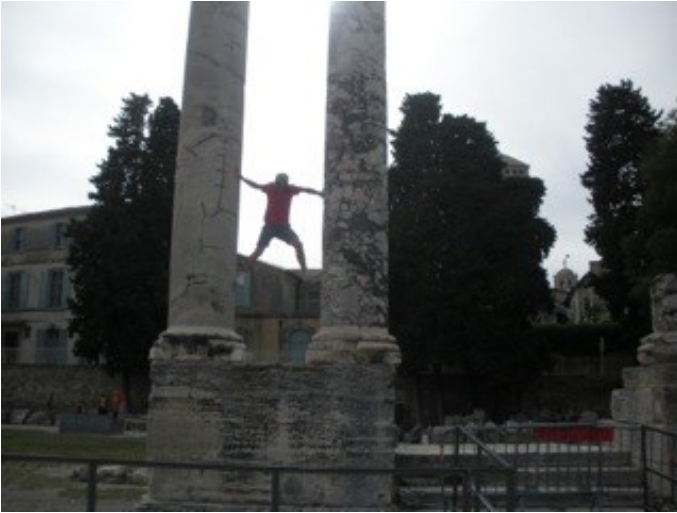
Theater in Nîmes