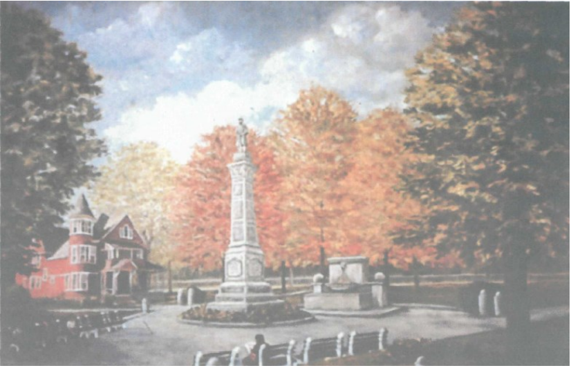
Naugatuck Green