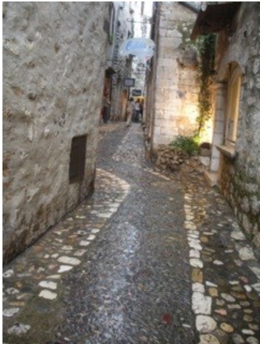
St. Paul, Provence