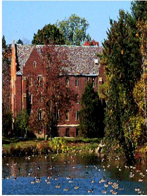
COLLEGE OF LIBERAL ARTS AND SCIENCES, UNIVERSITY OF CONNECTICUT