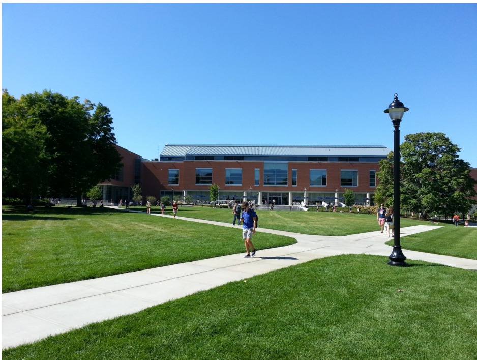
The Student Union

This edition's picture is of the Student Union, home of the Oasis lounge and a whole bunch of other things that you probably already know about.