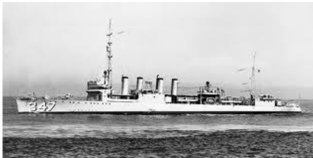
The USS Pruitt

He was laid to rest in Section 18 at Arlington National Cemetery.