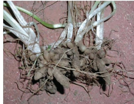
Fig buttercup is a vigorous growing vernal plant that forms large, dense patches in floodplain forests and some upland sites, displacing many native plant species, especially those with the similar spring-flowering life cycle. Spring ephemerals complete the reproductive part of their life cycle and most

of their above-ground development in the increasing light of late winter and spring, before woody plants leaf out and shade the forest floor. Some examples of native spring ephemerals include bloodroot, wild ginger, spring beauty, harbin-ger-of-spring, twinleaf, squirrel-corn, trout lily, trilliums, Virginia bluebells, and many, many others. These plants provide critical nectar and pollen for native pollinators, and fruits and seeds for other native insects and wildlife species. Because fig buttercup emerges well in advance of the native species, it has a developmental advantage which allows it to establish and overtake areas rapidly.