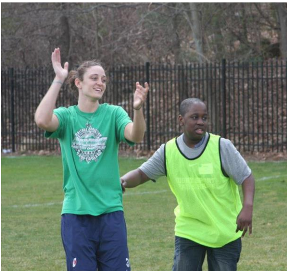
Sportsmanship is about acknowledging our opponents.

The Community Celebration and Field Day was a terrific success! Thanks to its many devoted supporters.