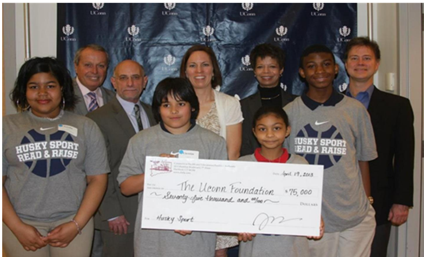
The Connecticut Health and Educational Facilities Authority recognize Husky Sport with $75,000 at Community Celebration

The final donations of Ignite! completed a season of support for Husky Sport in order to continue