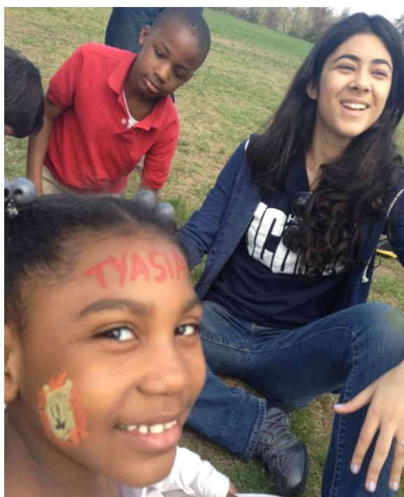
K-2 nd top readers enjoying their field day and celebrating the end of a successful of Read & Raise semester.

Partnerships and programming continued as well with the Hartford Catholic Worker House (Green House), the Salvation Army North-End Corps and the Community Renewal Team-Generations, featuring the famous annual Green House Halloween celebration. Husky Sport also hosted clinics with physical activities, sport drills, stretching, and a special presentation on healthy choices to get active at the Renzulli Gifted and Talented Academy and West Middle School, both in Hartford.