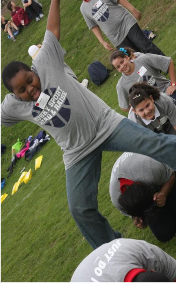
Students play Leap Frog in the nutrition station in a race to answer My Plate trivia!