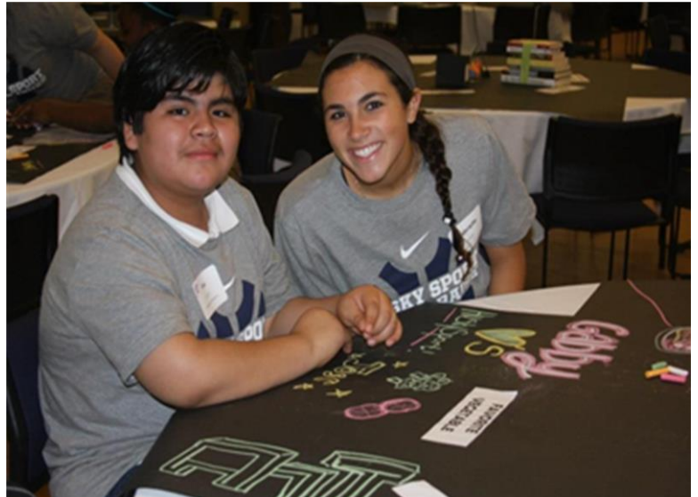
Who wouldn't grin over the prospect of such a great brunch?

The Community Celebration and Field Day was a terrific success! Thanks to its many devoted supporters.