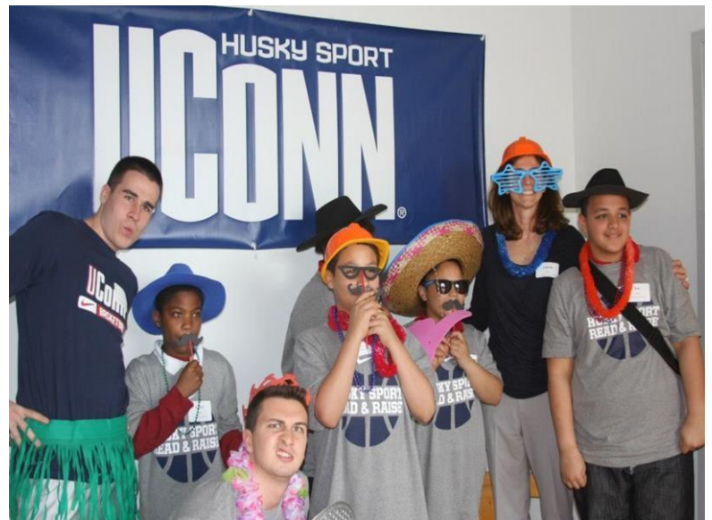
Getting silly at the Community Celebration

Visit Facebook to view more highlights from the experiences of the over 300 people gathered at the University of Connecticut on April 19th.