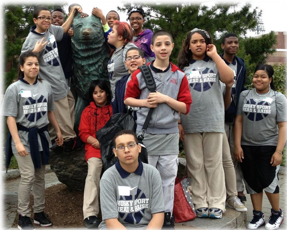
Top readers from Fred D. Wish School during their visit to UCONN for the annual Community Celebration and Field Day