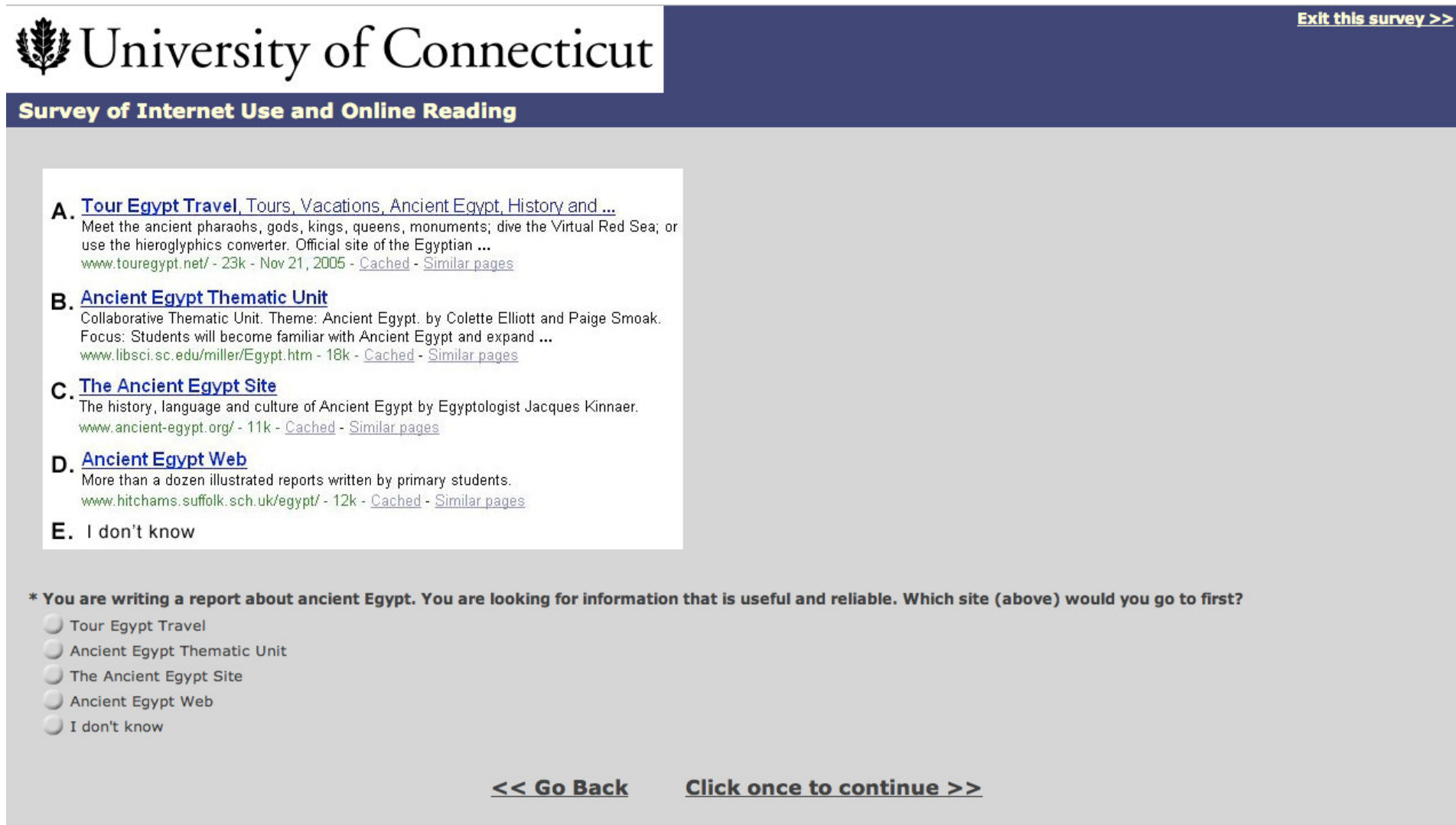
Figure 1. An illustrative example for measuring the reading of search engine results to make the correct inference as to which link is likely to provide more appropriate information than others, for a given purpose.